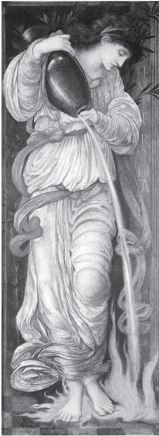
Figure 2. Edward Burne-Jones, Temperantia , 1872.

Nodding, the apostle says, in effect, “You got me. I have been hanging out with all of these people. I have been talking their talk, drinking their wine, listening to their worries, and rooting for their basketball teams. I have been all things to all people. Guilty as charged. Now, ask me why. Why have I contorted myself day after day? Why have I inserted myself into the middle of all these different people’s lives?”