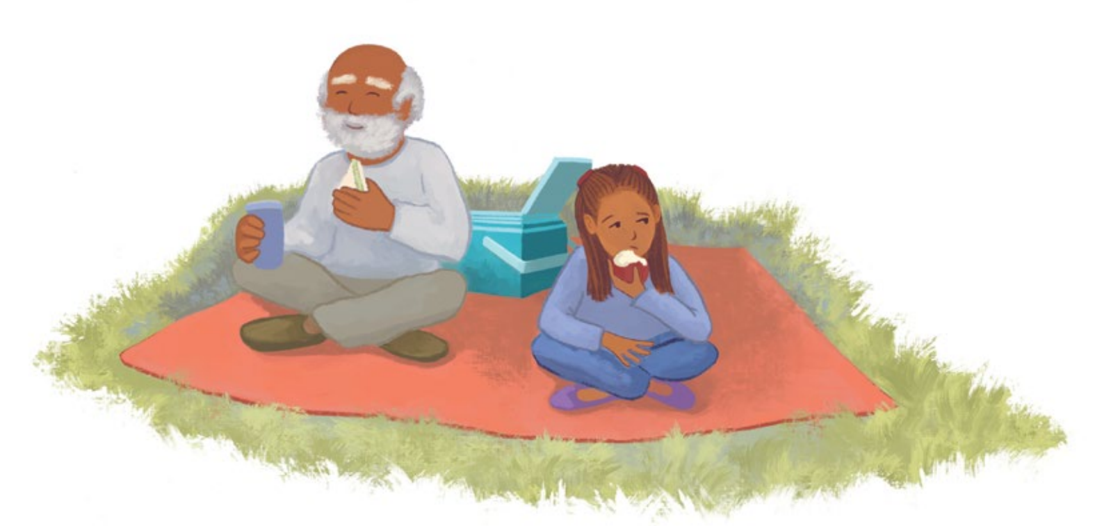
So they were quiet. The ducks, not so much.