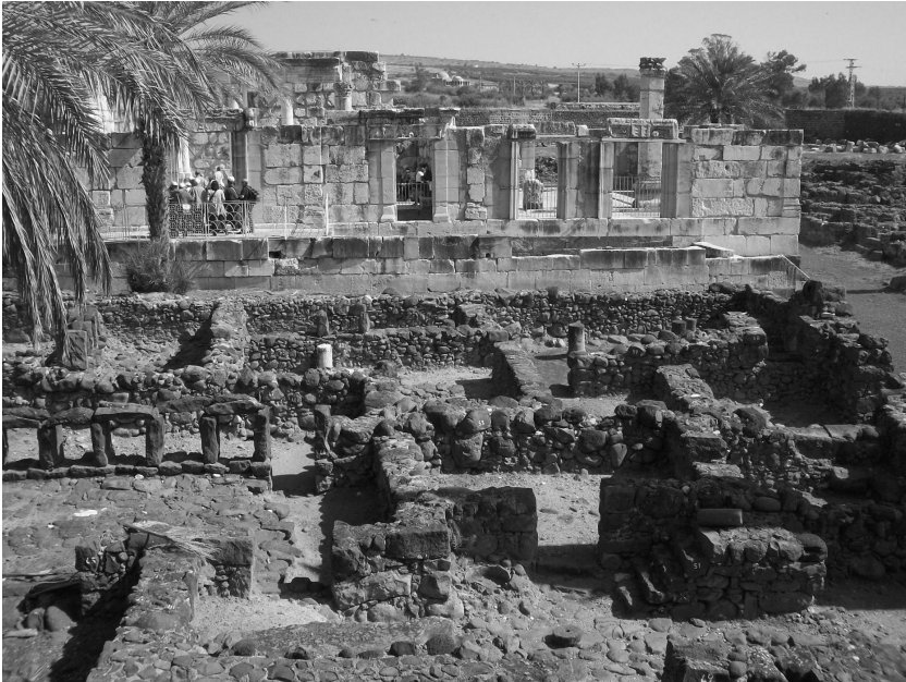
Figure 1.5 First-century Capernaum

Excavations of first-century Capernaum have uncovered floors, foundations and lower portions of the walls of various buildings and private homes. The dark stone is volcanic basalt. The limestone synagogue in the background dates to a later time.