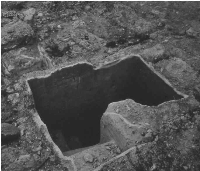
Figure 1.3 Miqveh , Sepphoris

But there is still more. Coins minted at Sepphoris during the pre-70 CE period do not depict the image of the Roman emperor or pagan deities, as was common in the coinage of this time. In contrast,