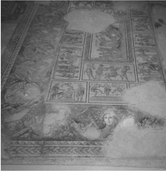
Figure 1.4 Sepphoris Mona Lisa

This beautiful floor mosaic graces the triclinium ('reclining on three sides') of the dining room of an impressive mansion, dating to the third century. The face of the lady of the manor, dubbed by some the 'Mona Lisa of Galilee', is prominently depicted (lower centre).