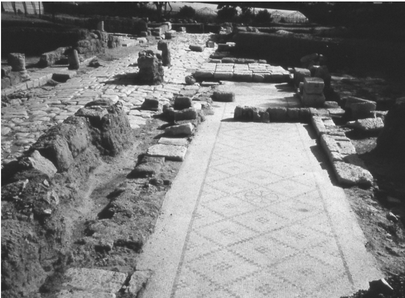
Figure 1.1 Sepphoris street walk

And this is just what the archaeological evidence shows: the Jewish faith and lifestyle were taken seriously. So how Jewish or Greek was Sepphoris, the city near the village of Nazareth, in the time of Jesus? This is a very important question. Much of the archaeological work in the 1970s and 1980s revealed the extent of building. Besides paved, colonnaded streets (Figure 1.1) and large buildings, a public